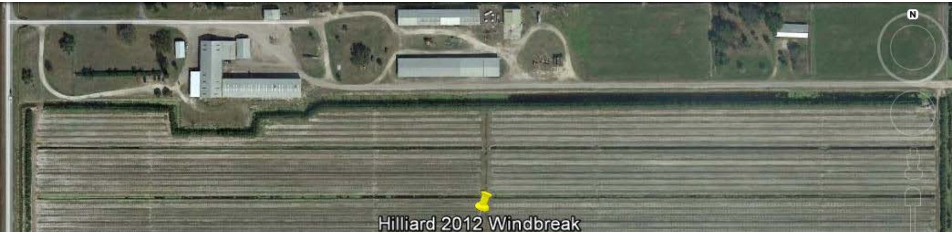
Hilliard 2012 Windbreak